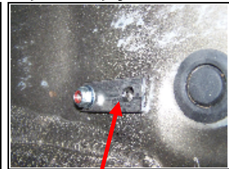
3" x 1" Back up Plate on Floor on each floor location